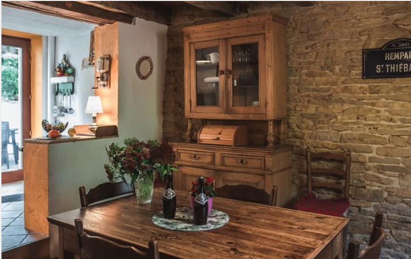
Attribution : (Love & Rose'ali)