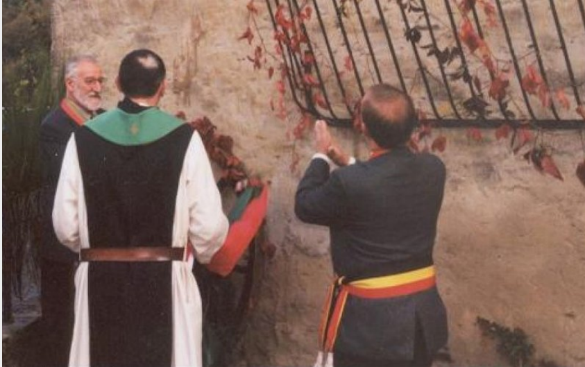
Attribution : (Libre de droit)