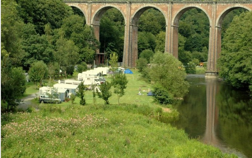
Attribution : (FTLB - P.Willems)