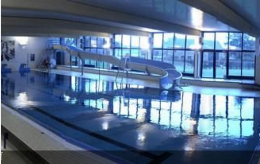
Attribution : (Complexe Sportif)