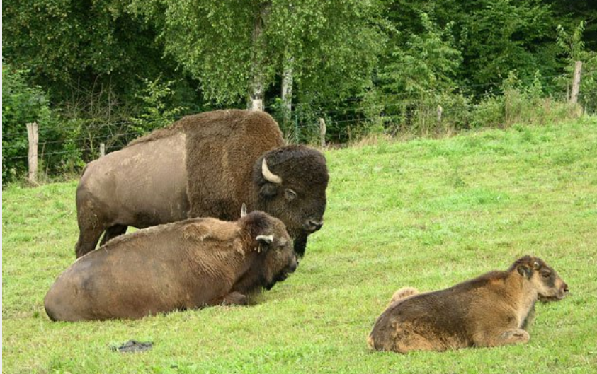
Attribution : (Libre de droit)