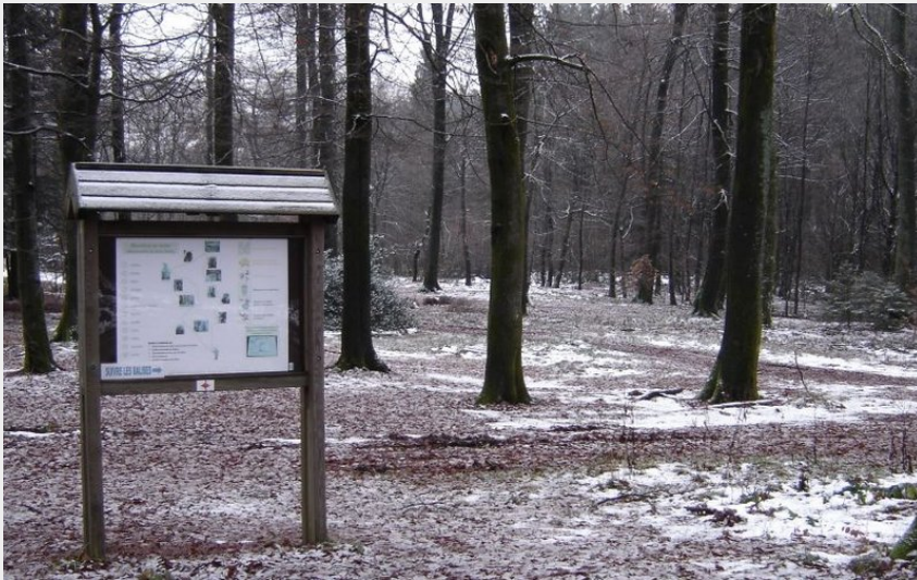
Attribution : (MTBA)