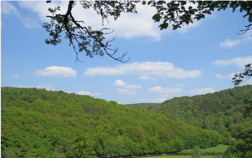
Attribution : (Aline Villeval)