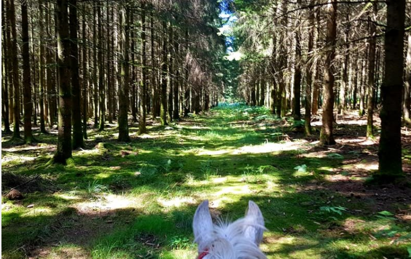
Attribution : (Ferme Equestre de Martué)