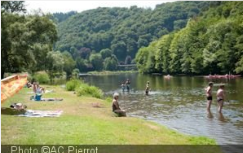
Attribution : (AC Pierrot)