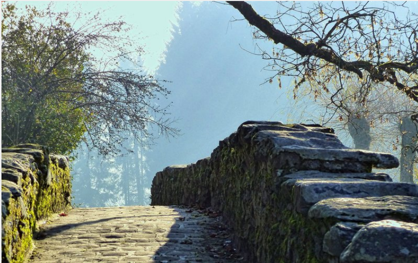
Attribution : (P.Ongena)