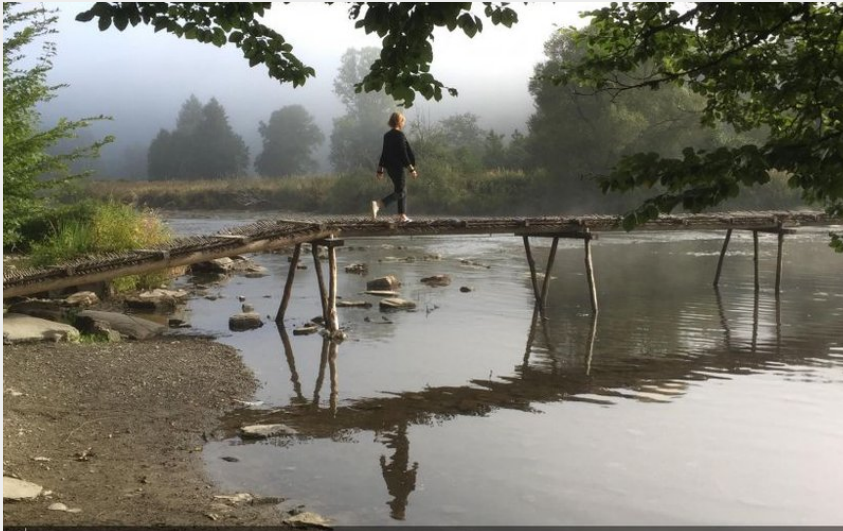
Attribution : (M. Léonard)