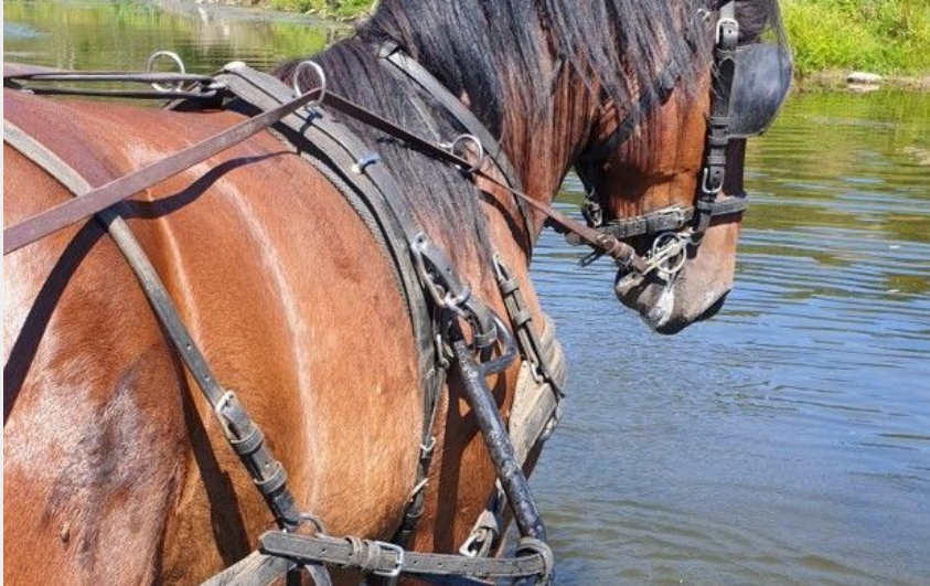
Attribution : (Ecurie de la Plaine)