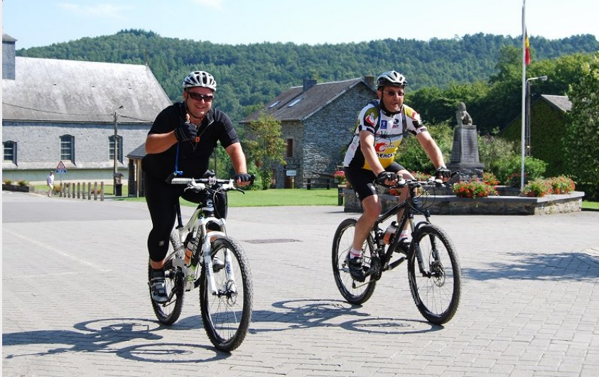
Attribution : (Libre de droit)