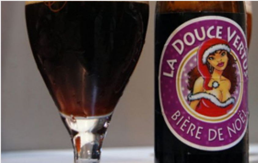
Attribution : (La brasserie artisanale Millever)