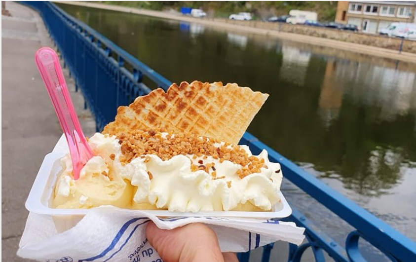
Attribution : (Gigot)