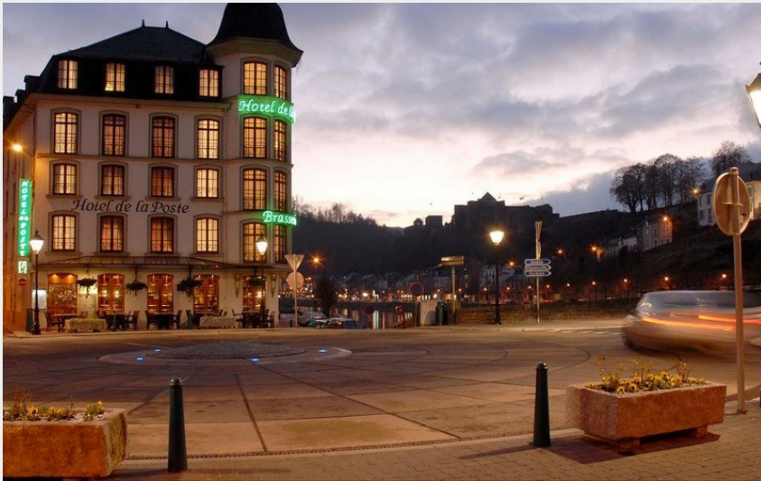
Attribution : (Hôtel de la Poste)