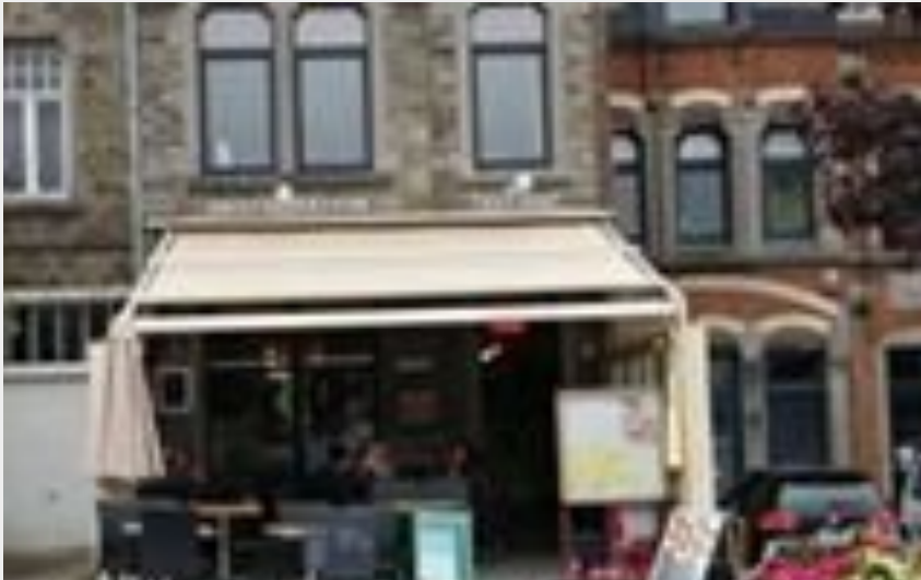
Attribution : (Bernard Collin)