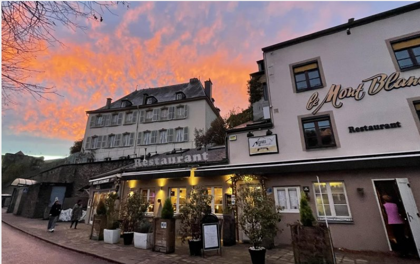
Attribution : (Mont blanc)