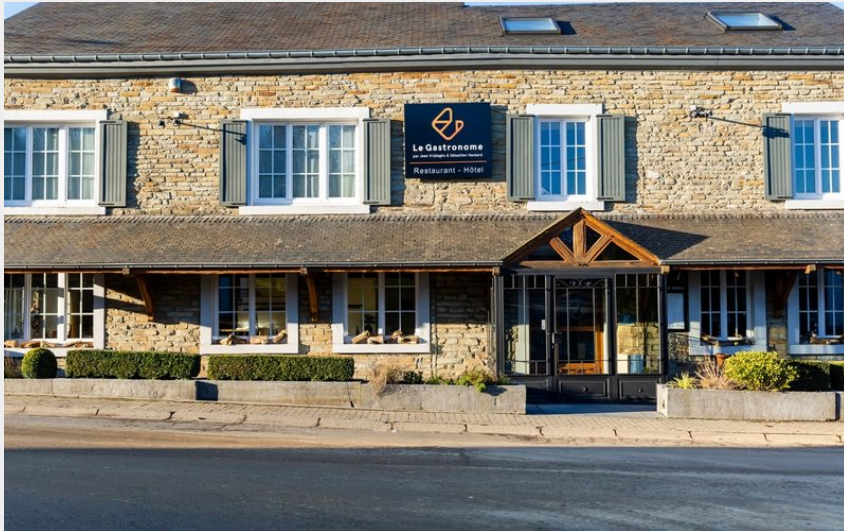
Attribution : (Le Gastronomo)