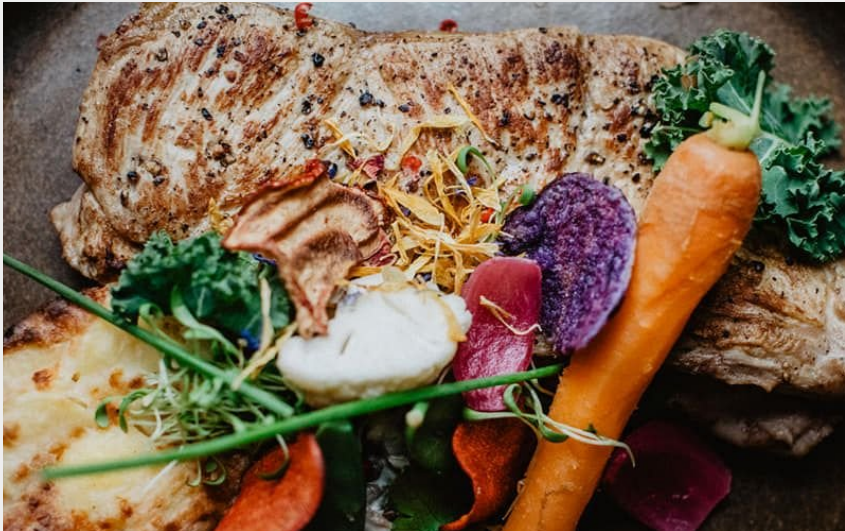
Attribution : (Le Relais des Oliviers)