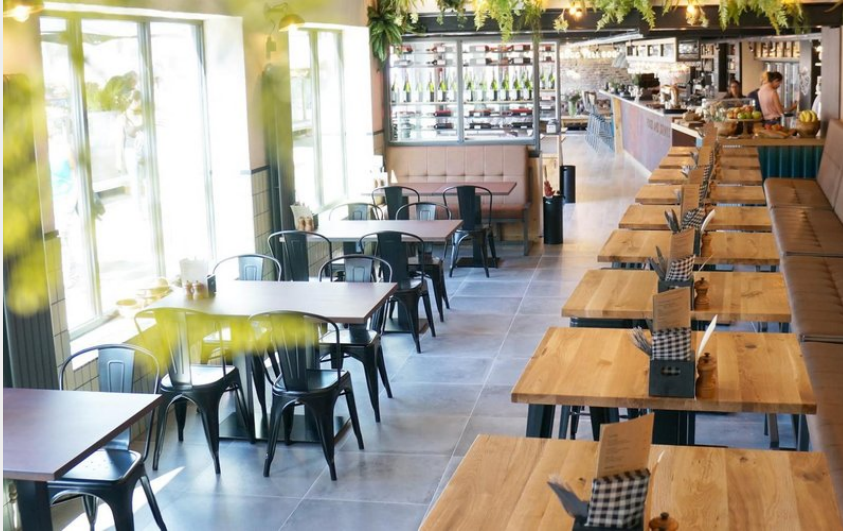
Attribution : (Celina Bom)