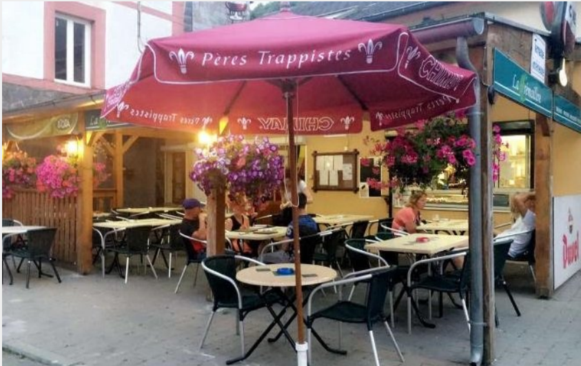
Attribution : (Au Délices de la Semois)