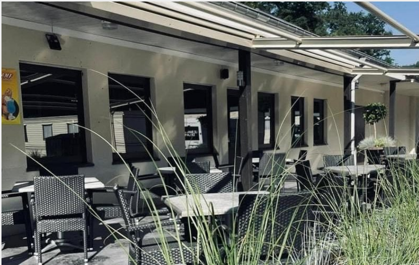
Attribution : (Le Ban de Laviot)