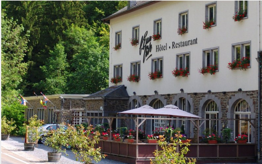
Attribution : (mtb)