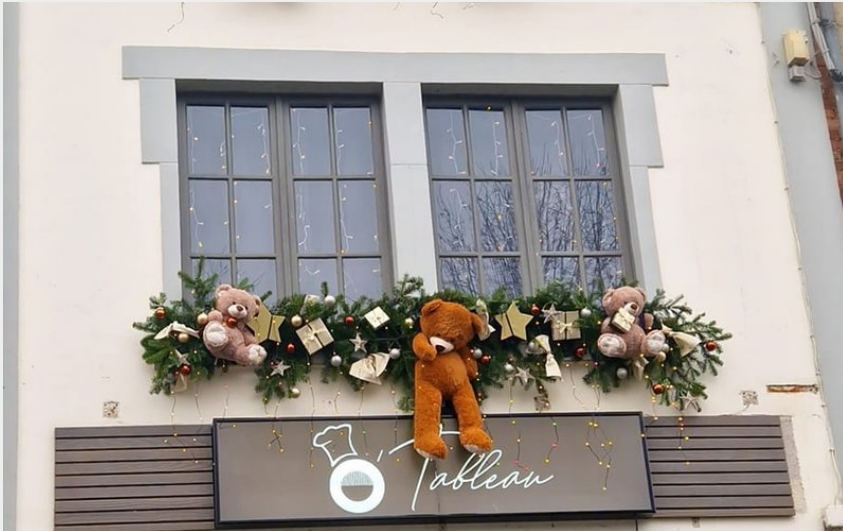
Attribution : (Ô Tableau)