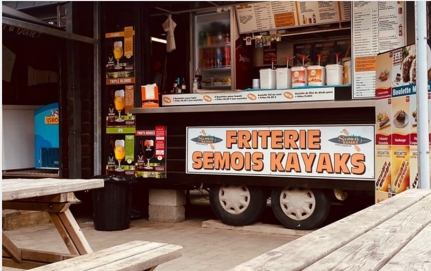
Attribution : (Friterie Semois-Kayaks)