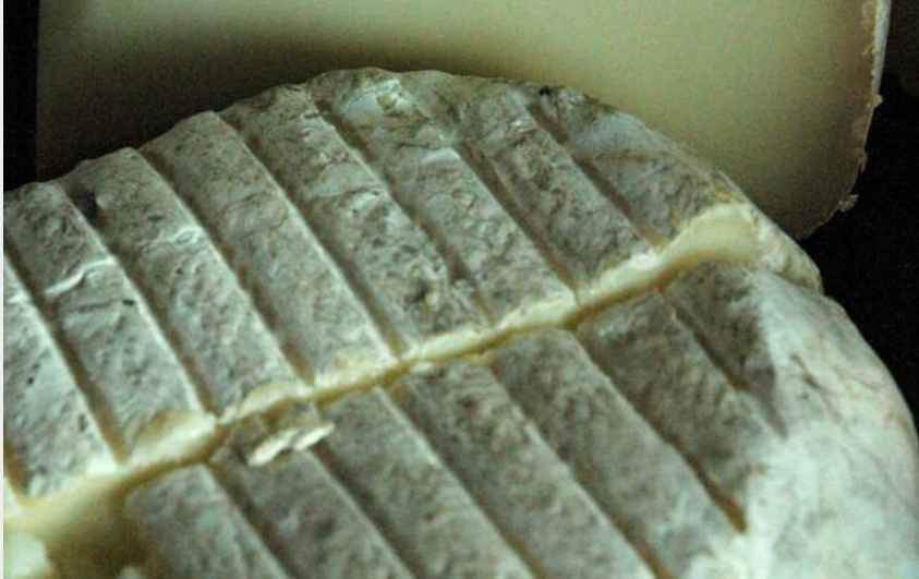
Attribution : (Libre de droit)