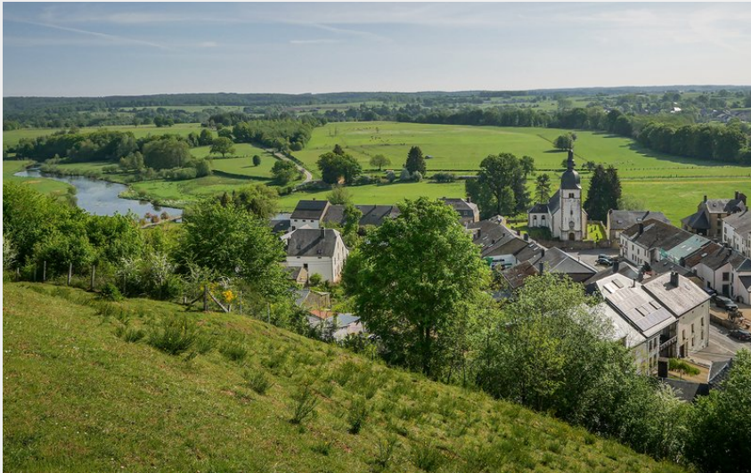
(Trekking & Voyage)