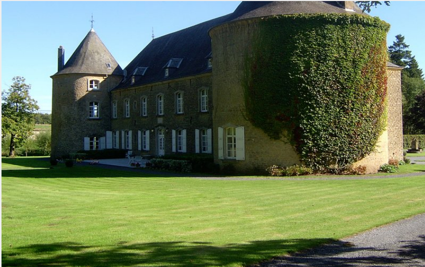
(SI de Tintigny)