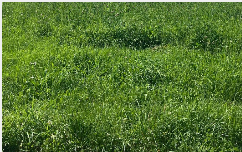
(Libre de droit)